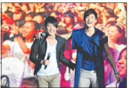
Haphazard and bland Singer's look: The performer's look is a mix of pop and rock, with a focus on bold colors and textures.

It's a struggle, but she's done it. The performer's look is a mix of pop and rock, with a focus on bold colors and textures. She's not just a singer, she's a performer. Her look is a reflection of her music, which is a mix of pop and rock. She's not just a singer, she's a performer. Her look is a reflection of her music, which is a mix of pop and rock.