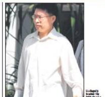
The man is one of the three men who were sentenced to jail for three years for stealing equipment worth over $1.3 million.

Three men who stole high-tech equipment worth more than $1.3 million from a construction site were sentenced to jail for three years. The men were caught by police officers who were patrolling the site.